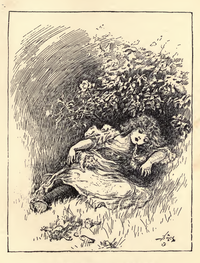
"I LEFT HER LAP AND CURLED UP IN HER ARM"